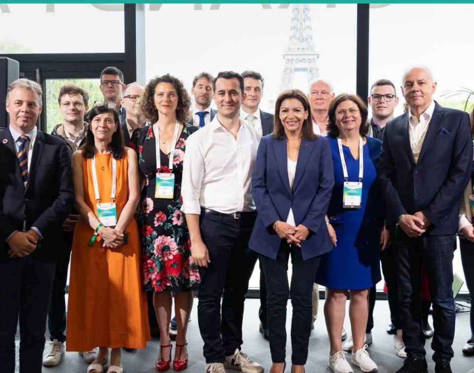
ANNE HIDALGO, Mayor of Paris with the city delegation, Grand Palais Ephemere, 2022